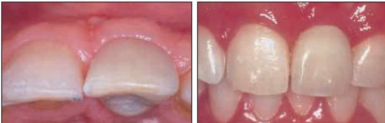
Fig. 6 Porcelain crown two years after implant placement.