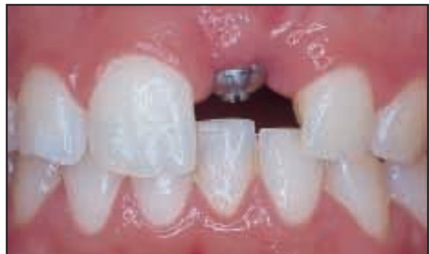
Fig. 5 Full-size implant placed in proper position.