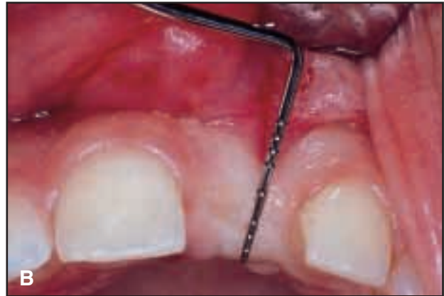
Fig. 4 A. Vertical height of ideal band of masticatory mucosa. B. Required length of displaced masticatory mucosa measured on occlusal.