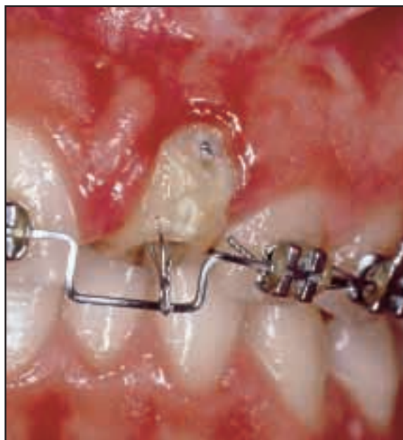
Fig. 3 After 16 weeks of extrusion, ligature wire is passed through small hole in residual root to continue movement.

A light, continuous force produced a vertical downward translation and a rotation in the sagittal plane, with a buccal movement of the apex. The final position of the residual root was almost horizontal at the top of the crest. The buccal marginal tissues followed the movement of the apex, but the change from inflamed alveolar mucosa to firm and healthy masticatory mucosa took several months (Fig. 4).