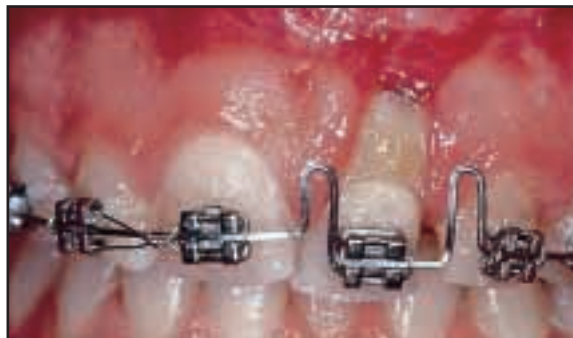
Fig. 2 Orthodontic appliance providing extrusive force and buccal root torque.

Edgewise brackets were bonded in the maxillary arch, with the central incisor bracket located more apically to provide an extrusive force (Fig. 2). The patient was seen every two weeks for grinding of the incisal surface of the extruded incisor. After 16 weeks of orthodontic movement, when no enamel remained to hold the central incisor bracket, a small hole was drilled in the buccal root surface of the left central incisor, and a ligature wire was passed through the hole to the extrusive arch to continue the orthodontic movement (Fig. 3).